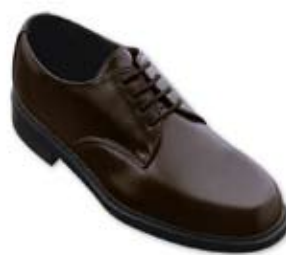
Chocolate Calfskin Lace (CCL)