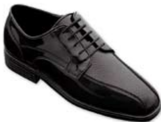
Protocol Snakeskin (BSS)