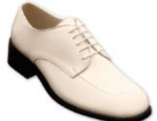
Ivory Square Toe Blucher (IST)