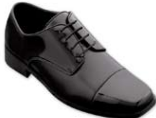
Tone-on-Tone Cap Toe (BCT)