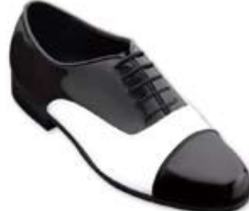
Black and White Cap Toe (BWC)