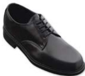
Black Calfskin Lace (BCL)