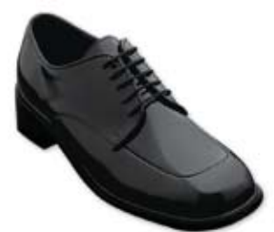
Black Square Toe Blucher (BST)