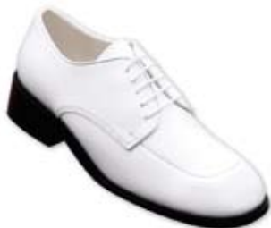
White Square Toe Blucher (WST)